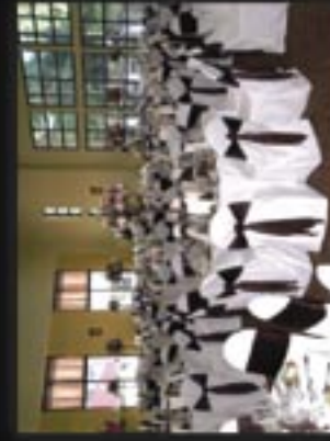
San Fernando's McCombs Hall