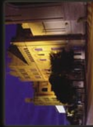
San Antonio Museum of Art